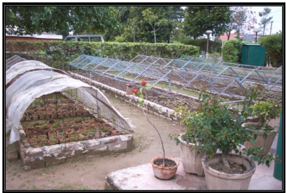
Showing four of the outdoors propagation beds