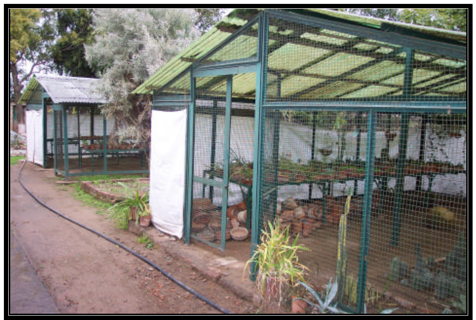
The two smaller houses in the propagation area