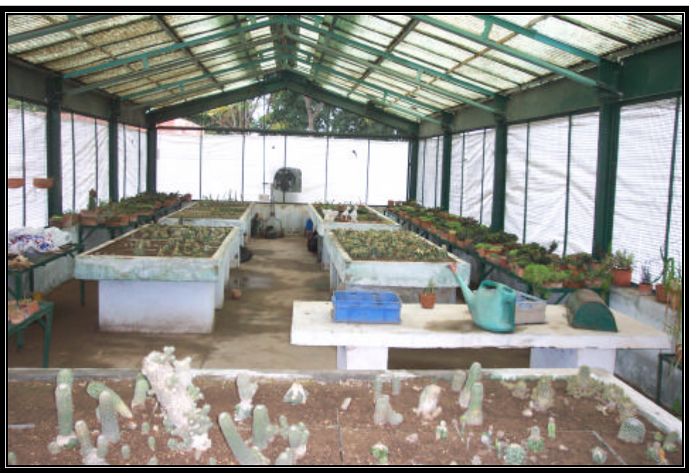
Propagation House 1.

humidity and weather protection to the plants inside. The houses have translucent fibre-glass sheet roof. One of these houses is used for the propagation of cacti, while in the other both cacti and succulents are grown. The interior of these houses is planned in such a manner so as to utilize maximum space for growing plants. The shelves along the length of the two houses are for early propagated potted plants.