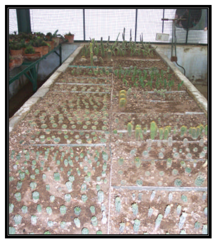
The bed across seedling trough in Propagation House 1

The seeds are sprinkled on the top of the soil. Most of the seeds need no further soil cover. Very large seeds are covered with a little soil mixture sprinkling. The pots are now enclosed in new clear polythene bags and the mouths are closed with a tie. The bagged containers are placed in the propagation trough D in house number I. An appropriate number of lights is switched on to give the necessary temperature. Seed germination usually takes place within a few days, but some may take a much longer time---maybe a few weeks.